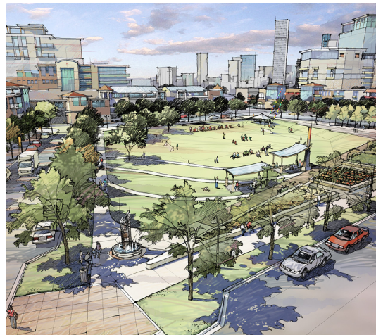
White Oak Music Hall