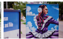
MINI MURAL - MAIN AT QUITMAN