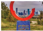
NEWLY INSTALLED 'SNAPSHOT' SCULPTURE