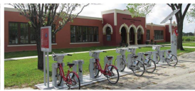
CIVIC PLACES STRENGTHEN PEDESTRIAN CONNECTIONS