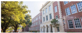
CHARACTER OF SCHOOLS GIVES HISTORICAL SIGNIFICANCE TO NEIGHBORHOOD